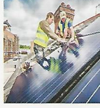
PV-T a win win for a