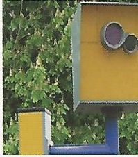
Speed camera con